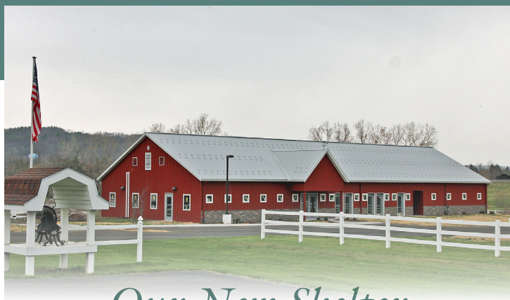
Our New Shelter