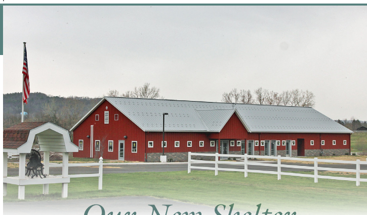
Our New Shelter